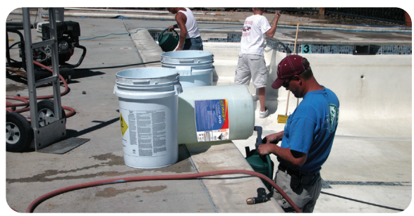
Available in convenient large drum sizes for commercial use. Save money and reduce waste.

ACID Magic is sold with exclusion of all warranty, expressed or implied, statutory or otherwise.